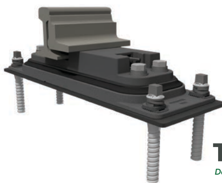
TOE Delkor Turnout Egg