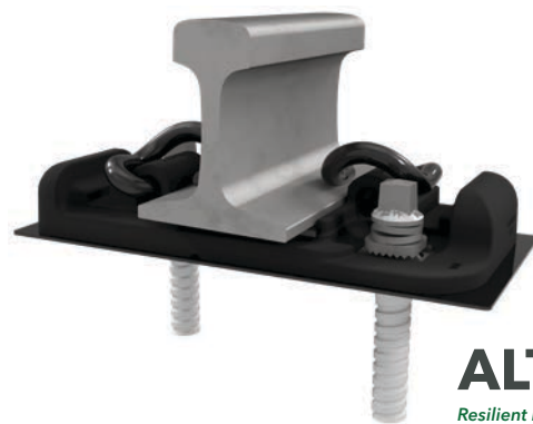
ALT-1 Resilient Fastener