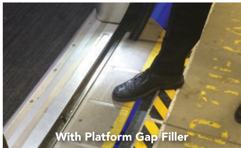
With Platform Gap Filler

Platform Gap Filler is an engineered sturdy, hard-wearing rubber profile that is mounted along the edge of a train platform to reduce the gap between the platform and the entrance of a passenger train; ensuring that when a train has stopped at a platform, passengers are able to enter and exit with safety.